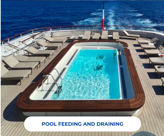
POOL FEEDING AND DRAINING