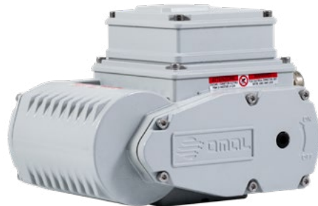
ELECTRIC ACTUATORS IP68